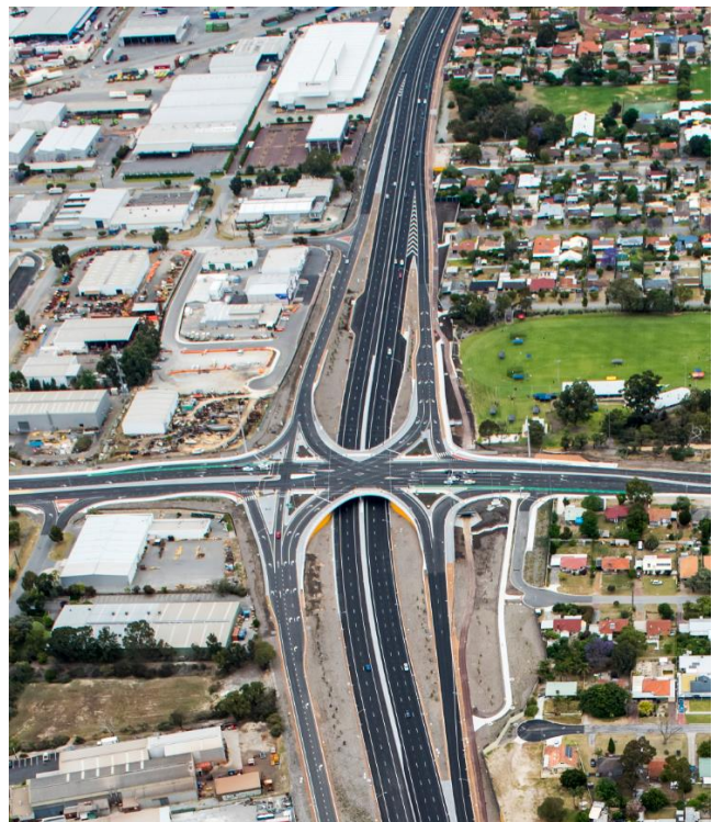
Above: An aerial photograph of the Leach Highway / Abernethy Road interchange, looking west, taken in October 2015.

The work is subject to weather and site conditions, which may result in changes to this schedule. In the event of changes, updated information will be available on the project website.